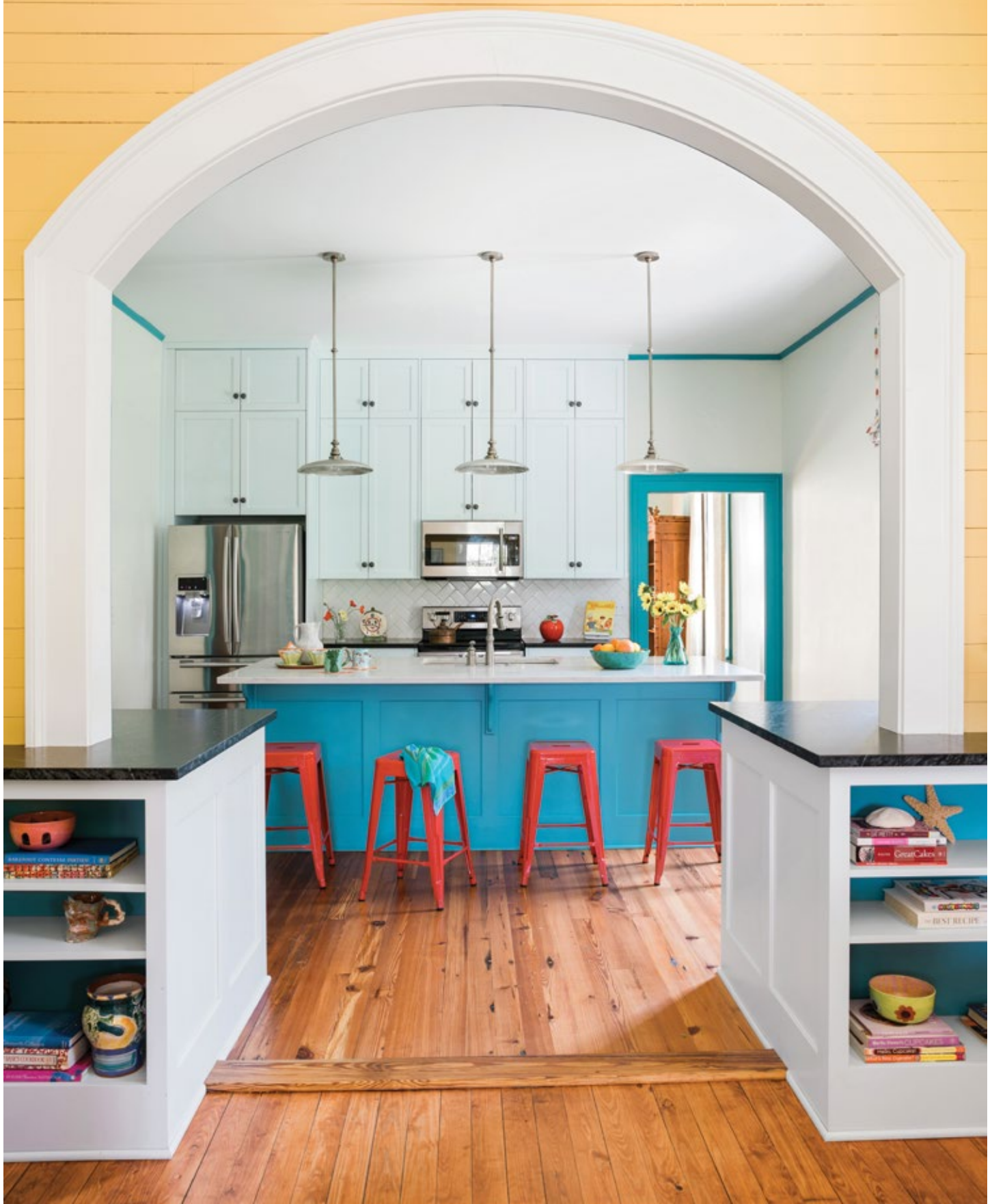
THE KITCHEN. which was once located in the rear of the house, now opens to the living room allowing for ease of entertaining. LEFT: A small table in the living room serves as the perfect spot for family game night.